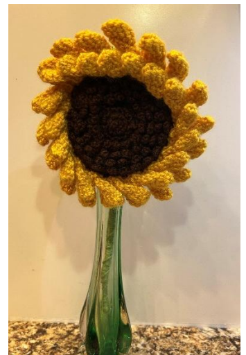
Crafted sunflower to tide me over until the garden grows, May 8/26