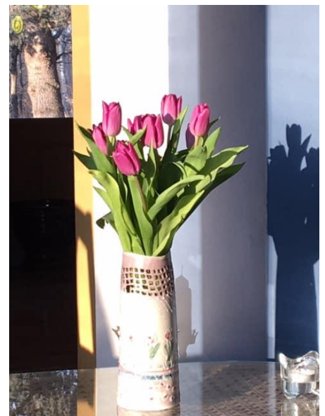
Easter Tulips in sunshine