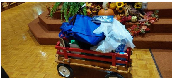
A wagon full of personal items gathered for women at Food Bank in Gananoque Ontario at our Fall rally.