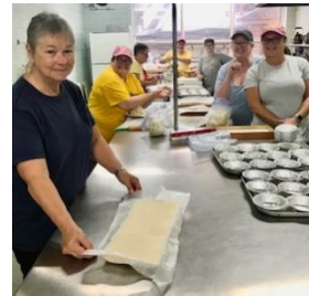
Pie prep for Bazaar Nov 1st