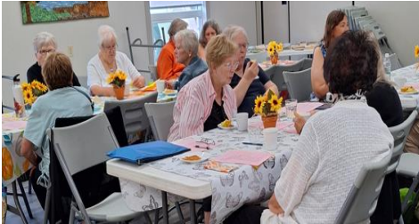
coffee and muffins on arrival

For over 40 years, the women of Central Alberta have held a Fall Rally in September. As 36 women gathered to share muffins and coffee, we reconnected with friends seldom seen from rural and urban areas. Stony Plain UCW had prepared the name tags, and Leduc UCW greeted registrants on arrival.