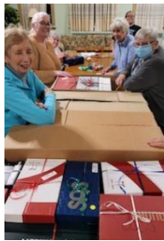
Prepping Christmas Shoebox gifts for Seniors