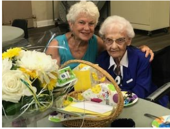
100th Birthday for one of Meat Delta's dearest members