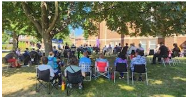
Welcome Back Service on the lawn September 14th