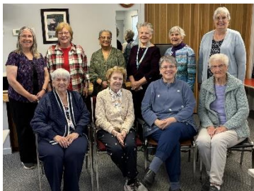
Shining Waters Region UCW Executive.