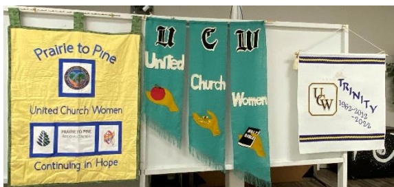
Banners through the years