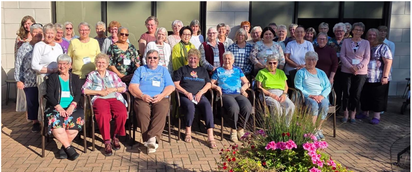
The National United Church Women Executive September 2025 – 2026

The Right Reverend Dr. Kimberly Heath Moderator United Church of Canada