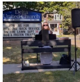
Welcome back Everyone