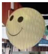
Members Line Dance and "Be Happy" at PM AGM this Spring.