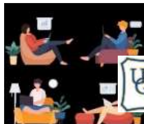
Meet Virtually

access the contacts for Region/District UCW. Membership and fees are managed by the Region/District or Area UCW depending on where you live.