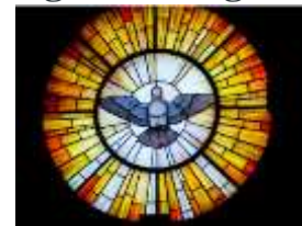
Beautiful Stained-Glass Window Living Skies Region

Discerning a Good Path Together United Church Women, part of SUCCW network, used their gifts and skills this past May, in Prince Albert, Saskatchewan, securing an information display table at the Living Skies Regional Council meeting. Pamphlets from many of the local and regional women's groups, copies of the NUCW published newsletter - Keeping in Touch Newsletter for UCW , information from Women's Inter-church Council of Canada (WICC), and Saskatchewan UCW Bursary Fund brochures were distributed.